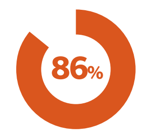
86% of the public say they trust the solicitor profession as a whole